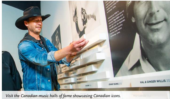
Visit the Canadian music halls of fame showcasing Canadian icons.