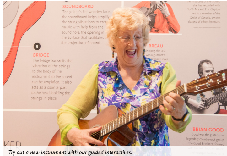
Try out a new instrument with our guided interactives.