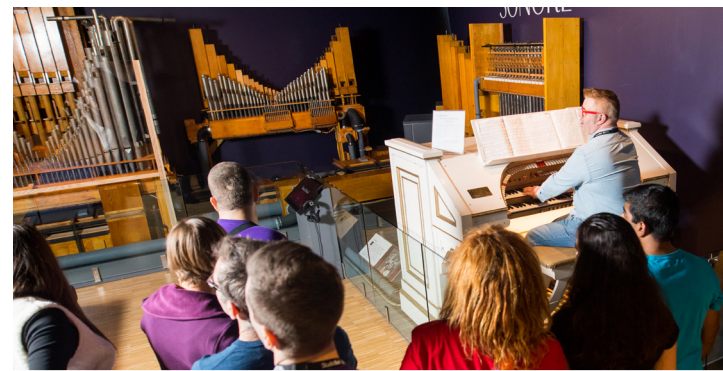
Book a private tour and demonstration of NMC's historic collection.