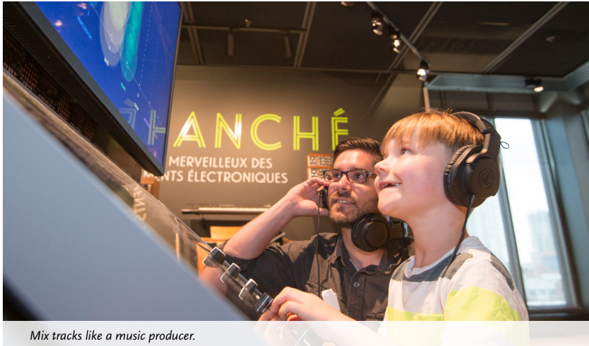
Mix tracks like a music producer.