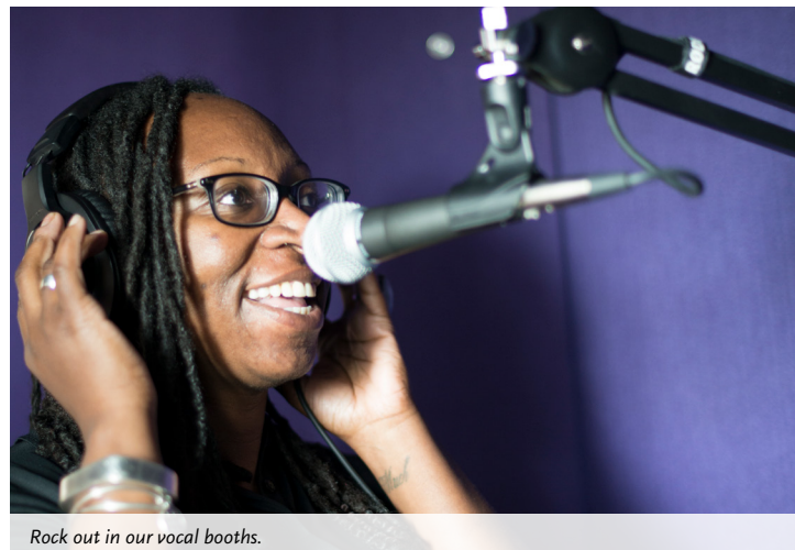
Rock out in our vocal booths.