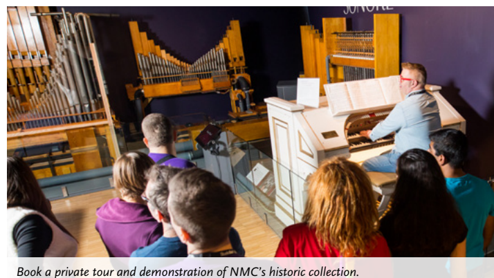
Book a private tour and demonstration of NMC's historic collection.