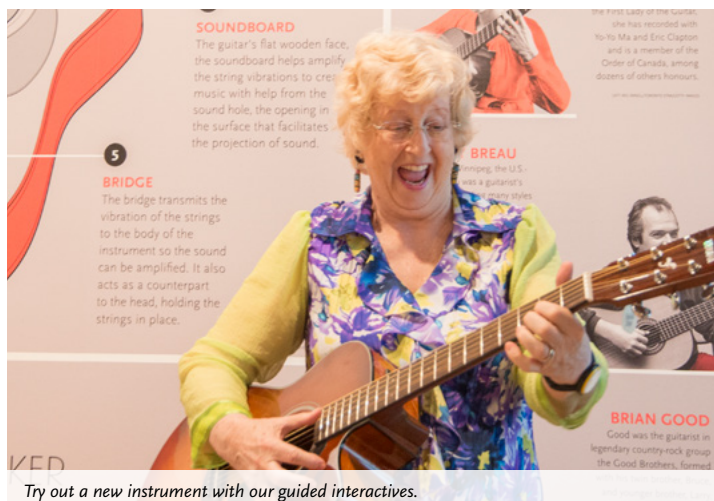
Try out a new instrument with our guided interactives.