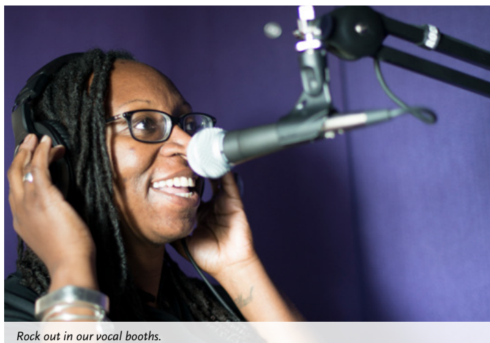
Rock out in our vocal booths.