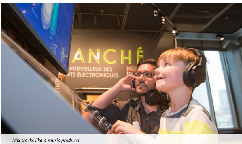
Mix tracks like a music producer.