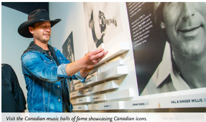
Visit the Canadian music halls of fame showcasing Canadian icons.