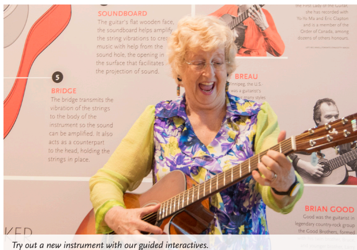
Try out a new instrument with our guided interactives.