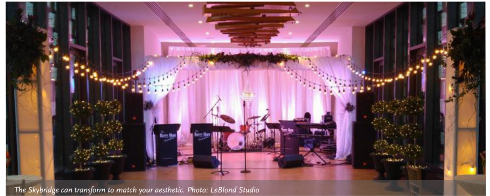
The Skybridge can transform to match your aesthetic.