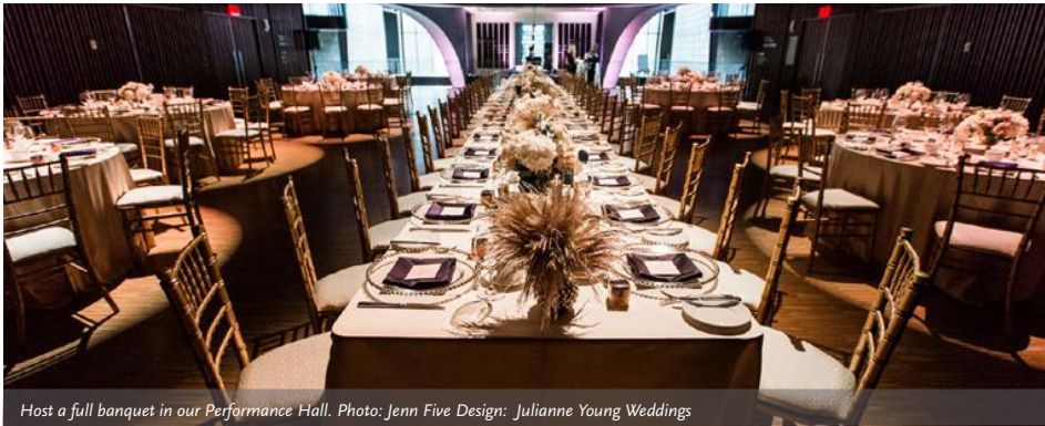
Host a full banquet in our Performance Hall.