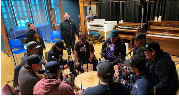
OHSOTO'KINO Recording Bursary participants the Blackstone Singers in NMC's recording studios.