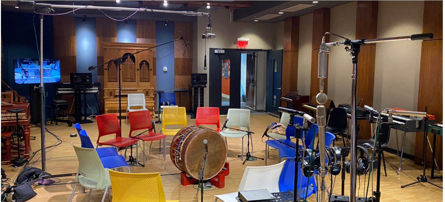
Northern Cree's set up to record in NMC's studios.