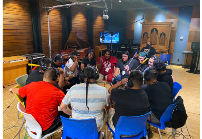
Northern Cree recording in NMC's studios.