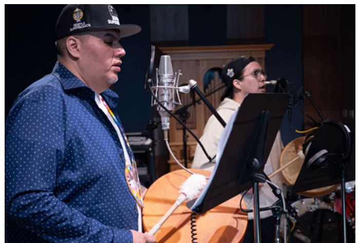
OHSOTO'KINO Recording Bursary recipients, Warscout.