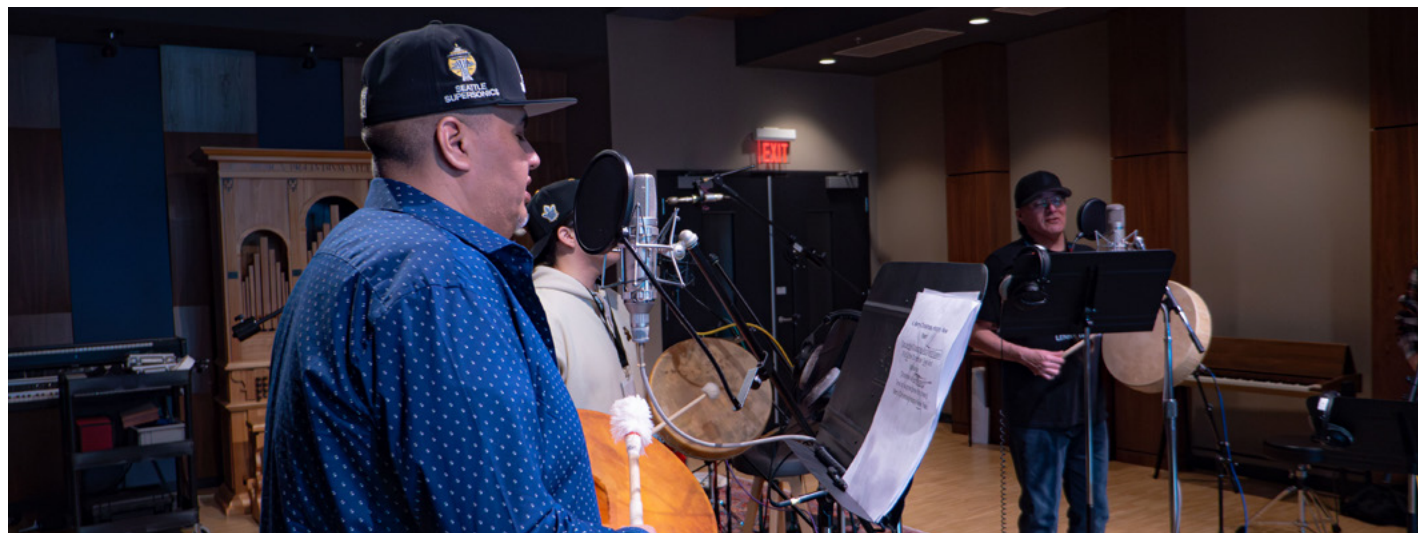
2024 OHSOTO'KINO Recording Bursary recipients, Warscout, recording in NMC's studios.

National Music Centre's OHSOTO'KINO initiatives at Studio Bell are made possible by support from TD.