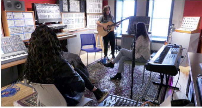
2024 Music Incubator artists at work in the NMC Studios.