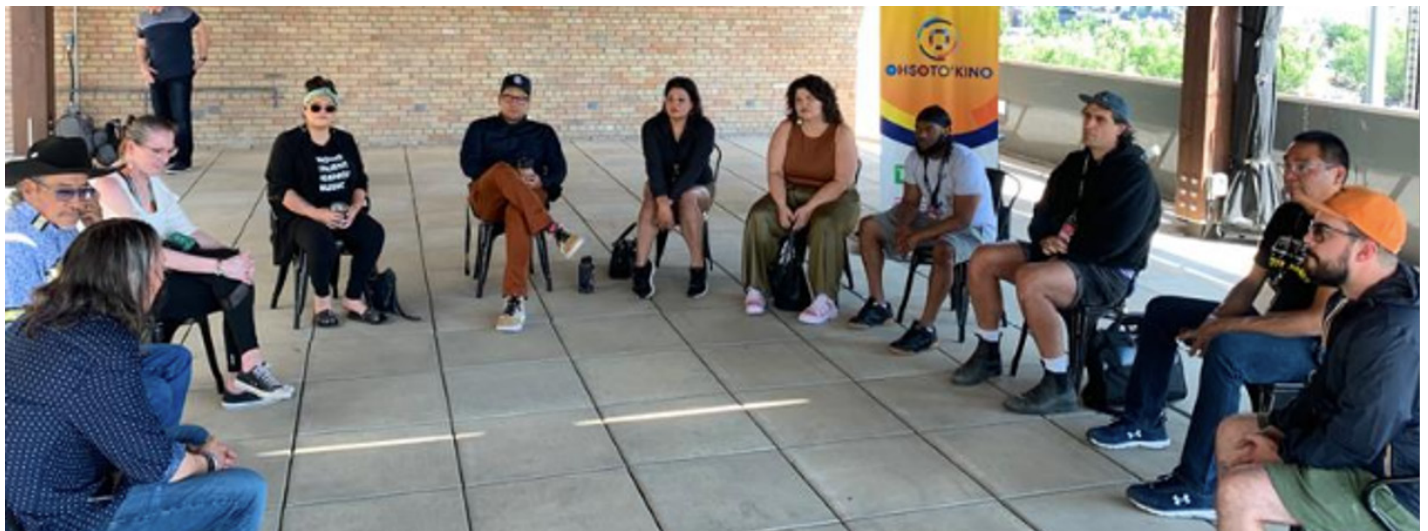
2022 OHSOTO'KINO Music Incubator artists and mentors.