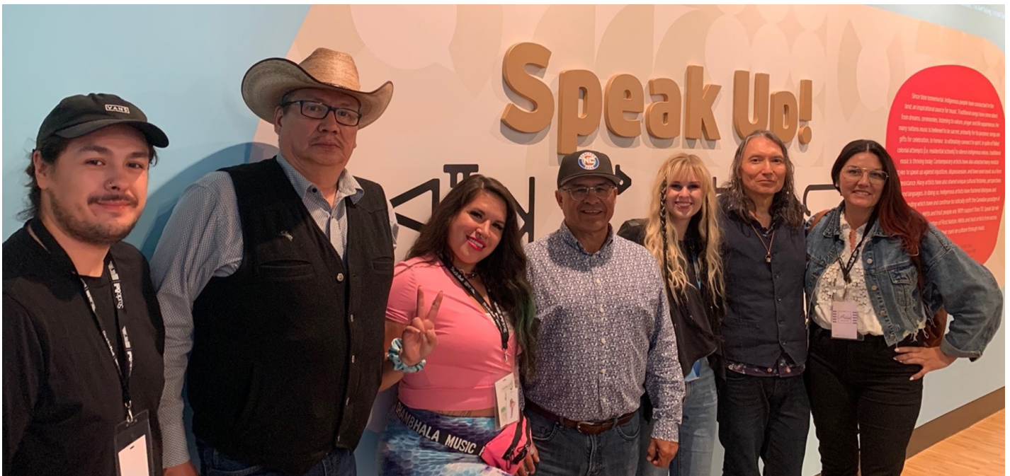
2023 OHSOTO'KINO Music Incubator artists and mentors.

NATIONAL INDIGENOUS PROGRAMMING ADVISORY COMMITTEE