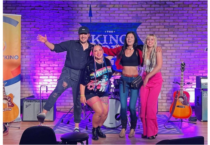
2023 OHSOTO'KINO Music Incubator artists and mentors.